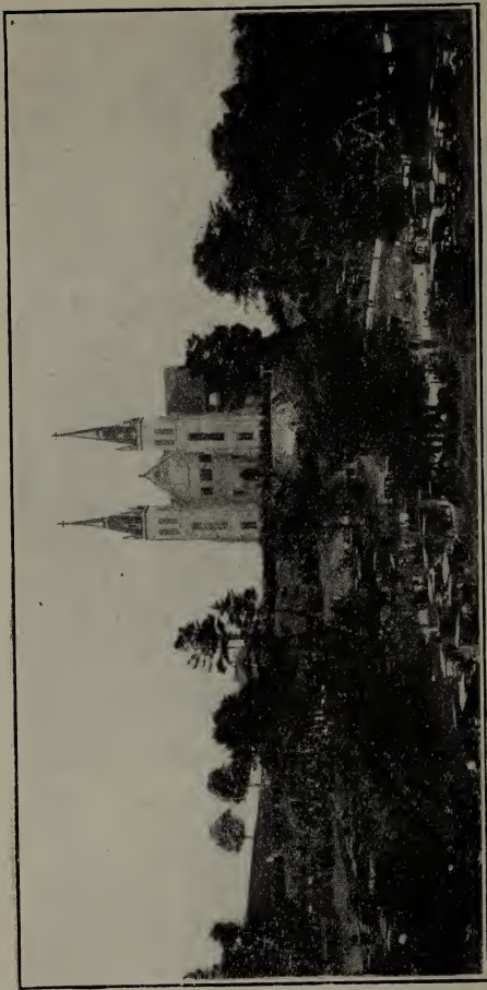
THE MARTYRS' SHRINE, FORT STE. MARIE Near Midland, Ont.